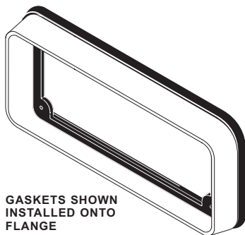
GASKETS SHOWN INSTALLED ONTO FLANGE

IMPORTANT: If your flange kit includes one or more gaskets, they must be used in the installation. Failure to do so can result in vehicle corrosion and the eventual failure of the lighthead.