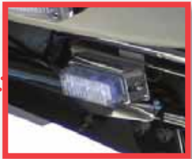
Optional Models RBKTHD4L (road side) RBKTHD4R (curb side) under radio box mounting bracket kit for one TIR3, LIN3 or LINZ6 horizontal mount lighthouse