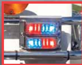
Optional Model RBKTHD3 , rear saddle bag crash bar mounting bracket kit for two TIR3, LIN3 or LINZ6 horizontal mount lighthoods