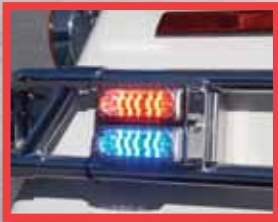
Optional Model RBKTHD2 , side saddle bag crash bar mounting bracket kit for two TIR3, LIN3 or LINZ6 horizontal mount lighthoods