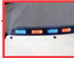
Optional Model M052J, LINZ6 motorcycle windshield light array