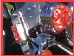
Optional Model RBKTHD1, windshield mounting bracket kit for one TIR3, LIN3 or LINZ6 vertical mount lighthead