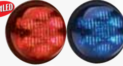
Optional 4" Round TIR6 Super-LED with extended lens