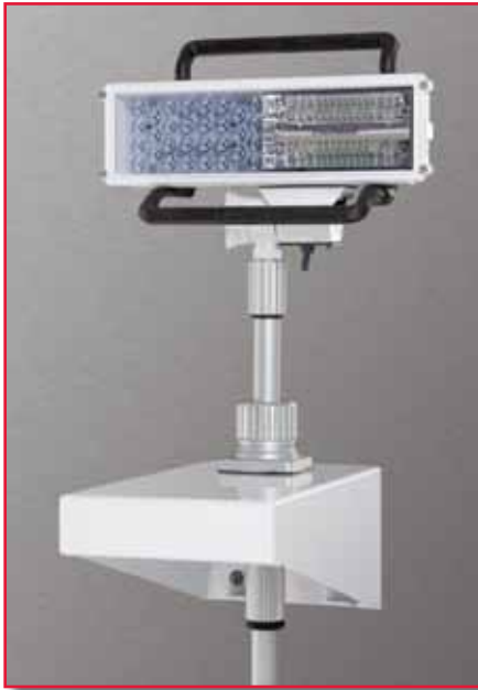
3100 Series Pole Top Adjust Pull-Up with PCP2 (Sold separately)