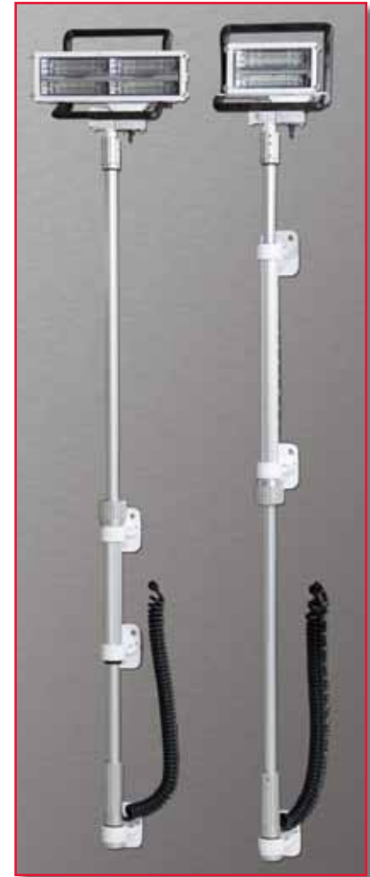
3000 Series Pole Top Adjust Pull-Up 12" Outer Body with PPF2 (Sold separately)