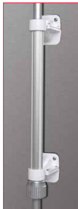
3000 Series Pole with 20" Outer Body