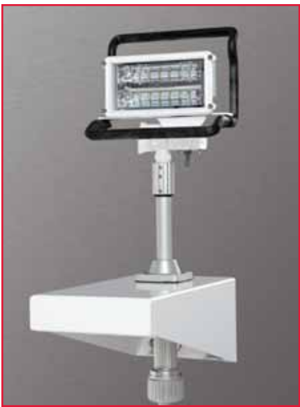
3100 Series Pole Bottom Adjust Push-Up with PPF1 (Sold separately)