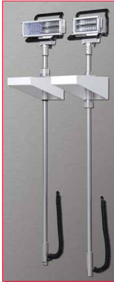
3100 Series Pole Top Adjust Pull-Up with PCP2 (Sold separately)