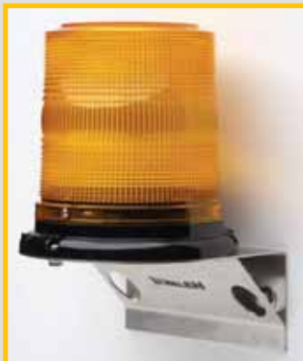
BBKT20 flat vertical surface mounting bracket

* Replace asterisk in model numbers with desired color. A = Amber, B = Blue, C = Clear, G = Green, R = Red