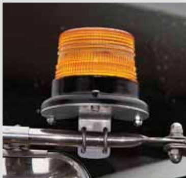
optional MIRROR15 mirror mount bracket.