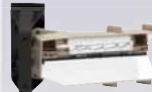
Angled Strobe Corner