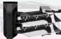
Angled Linear-LED Corner