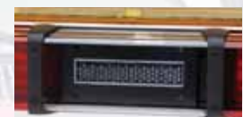
GTT Opticom™ Emitter 795H*