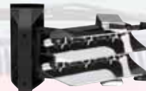
Angled Linear-LED Corner