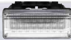
700 Series Linear-LED®