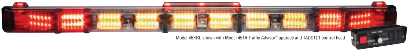
Model 45KRL shown with Model 45TA Traffic Advisor™ upgrade and TADCTL1 control head

Choose housing shell then pick the internal lighting package or options to fill your requirements