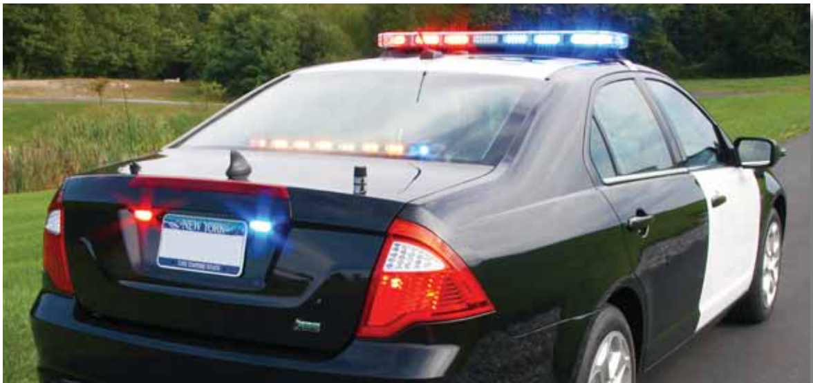
Eight lamp 6-LED Traffic Advisor with single end flashers