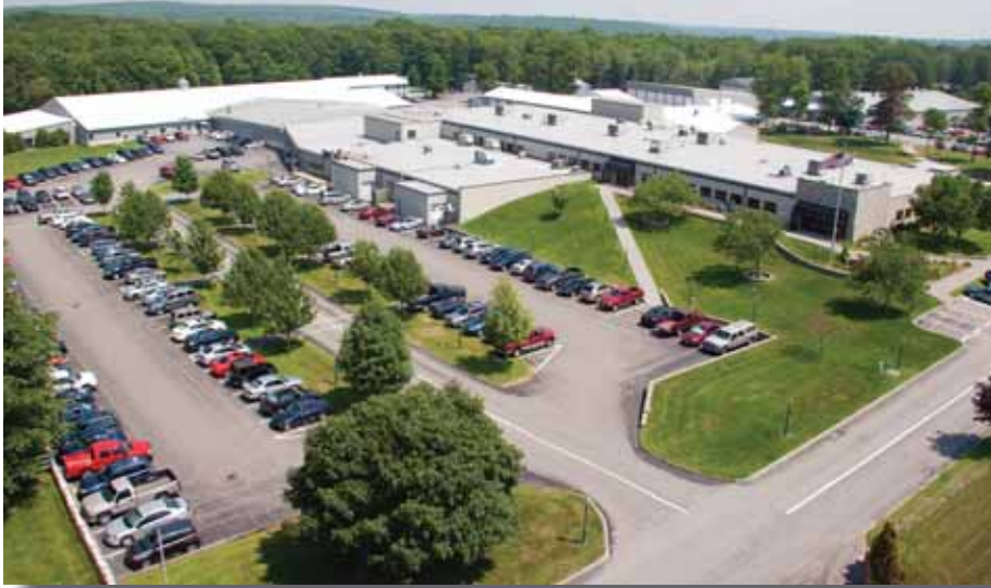
Corporate Headquarters, Chester CT