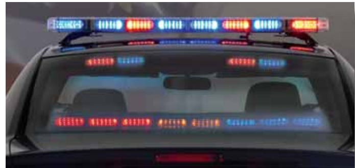
One piece 8 lamp rear facing Linear-LED® model mounted on the rear deck.

Refer to chart on last pages for information on how to order models to fit specific vehicles.