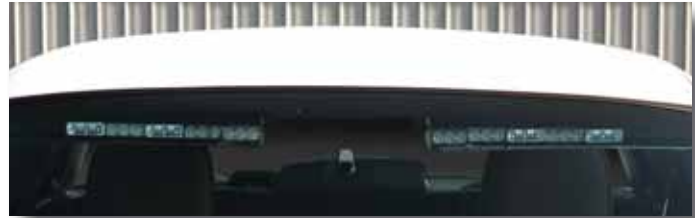
Two piece 3-LED model shown unlit for stealth appearance.