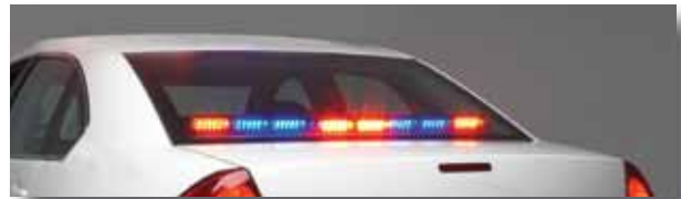
Eight lamp warning with Linear-LED modules.