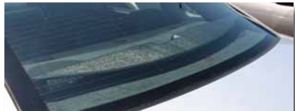
Top view of Inner Edge on rear deck of vehicle.