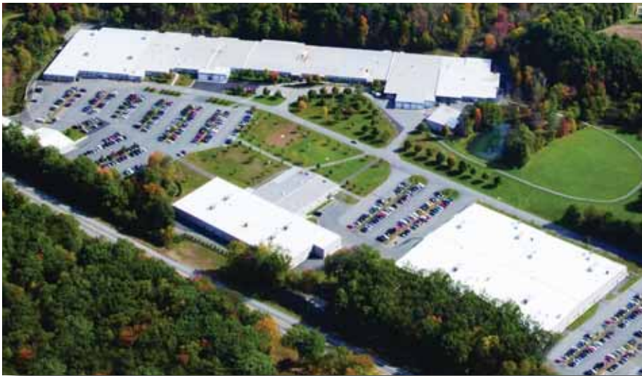
Charlestown NH Division

Whelen stands unchallenged as the only major Emergency Warning Manufacturer whose products are truly manufactured in America!