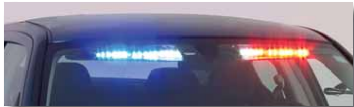
Two piece 6-LED model with all the brightness of an external top mounted lightbar.