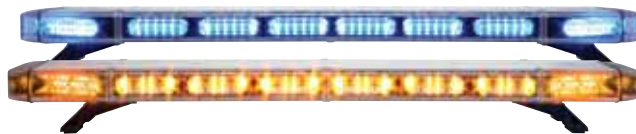
Switch warning colors with Blue/Amber DUO modules