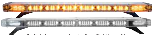
Switch from warning to floodlighting with White/Amber DUO modules