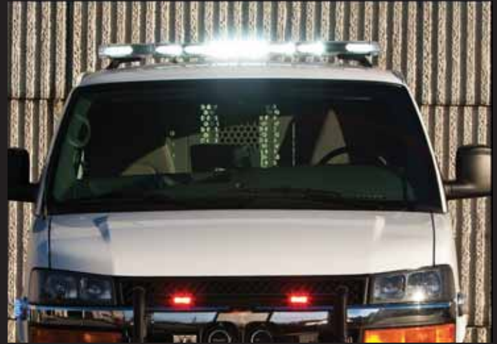
Go from a warning light to a flood work light with Red/White and Blue/White DUO modules