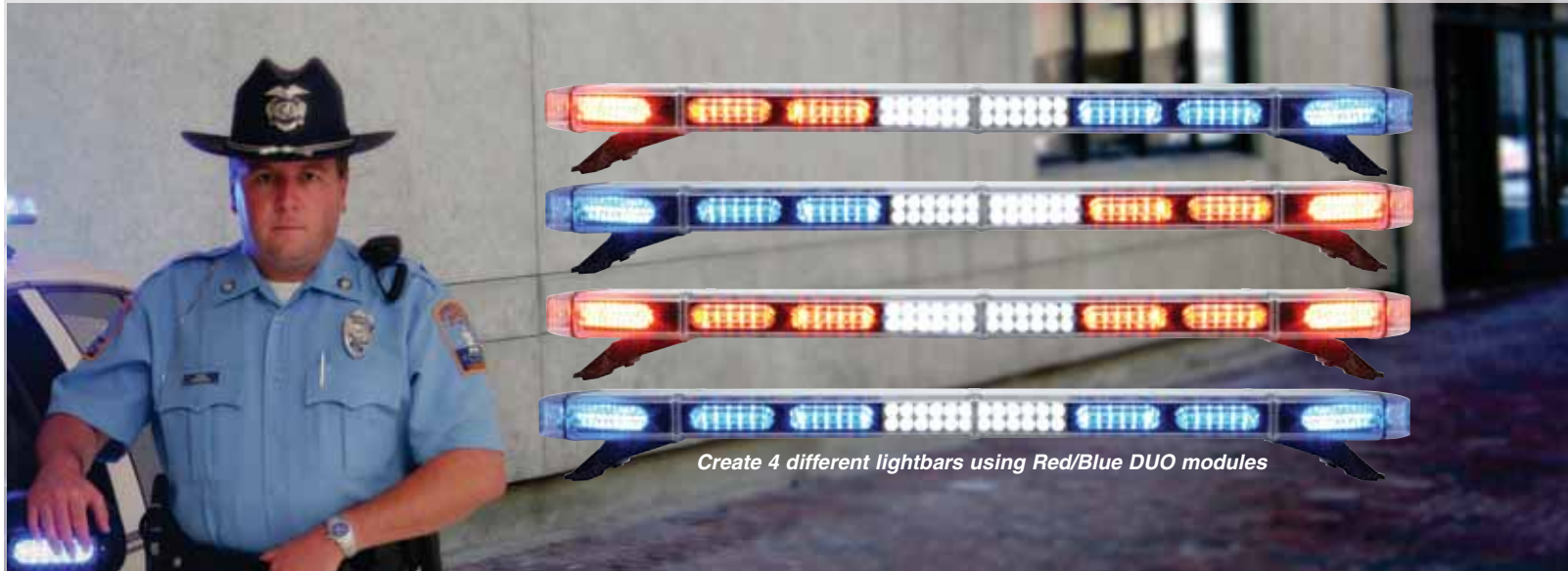
Create 4 different lightbars using Red/Blue DUO modules

A Super-LED ® lightbar that's as versatile as you are!