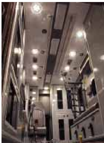
Installed 80C0EHCR's providing bright interior lighting in an ambulance.

Simulates natural light at mid-day for truer flesh tones and accurate patient evaluation. White lighthouse feature Hi/Low intensity mode standard.