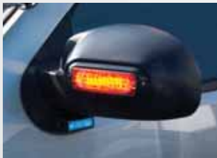
RBKT5 with TIR3™ lighthouse