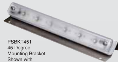
PSBKT451 45 Degree Mounting Bracket Shown with PSC0CDCR