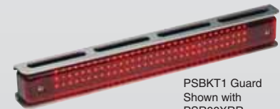
PSBKT1 Guard Shown with PSR00XRR