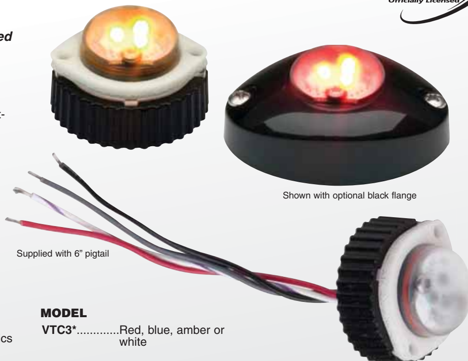
Shown with optional black flange

A cost effective Hideaway™ style light-head requiring only a one inch hole in any composite lighthead, cornering or taillight assembly, or surface mounted to exterior surfaces anywhere on your vehicle.