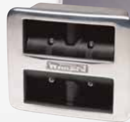
SACSTFMP Polished flange