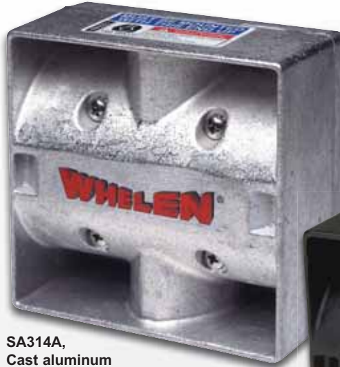
SA314A, Cast aluminum with natural finish

The SA314 100 watt siren speaker installs easily and delivers traffic clearing warning where it's needed: down and in front of your vehicle.