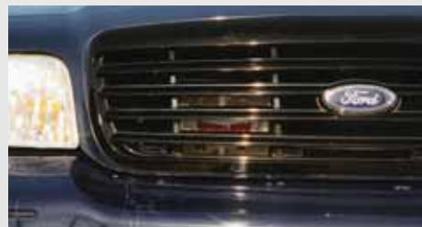
Concealed grille mount