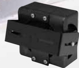
SABKT9 Universal swivel bail mount