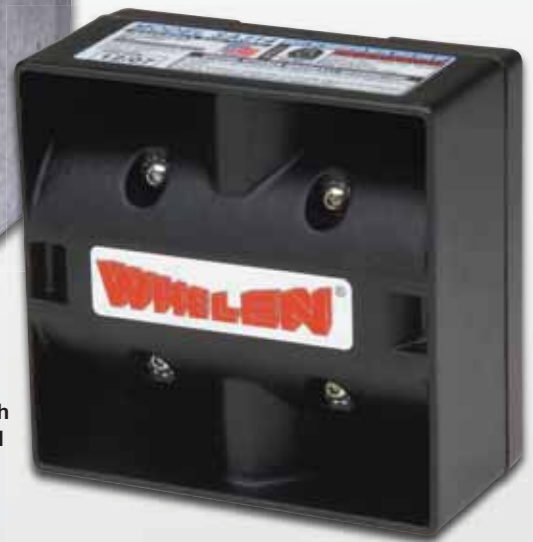
SA314B, Cast aluminum with black epoxy coated finish