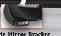
Side Mirror Bracket