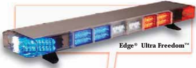
Edge® Ultra Freedom™