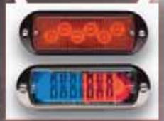
TIR6™ & LING™ Series