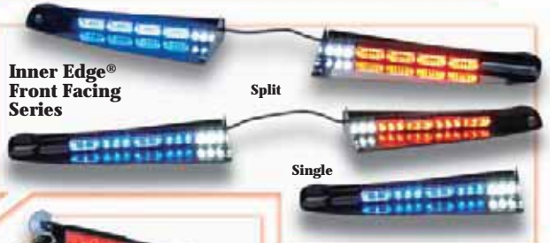
Inner Edge® Front Facing Series