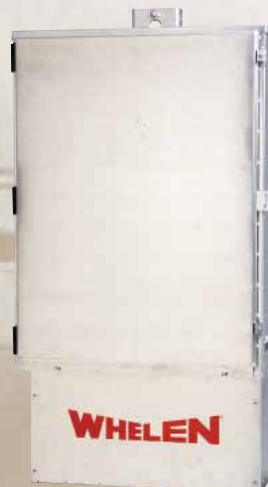
Type II Electronic Cabinet