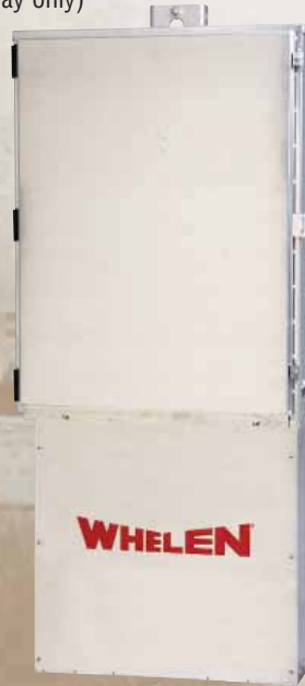
Type III Electronic Cabinet