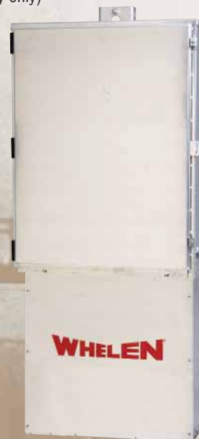
Type III Electronic Cabinet