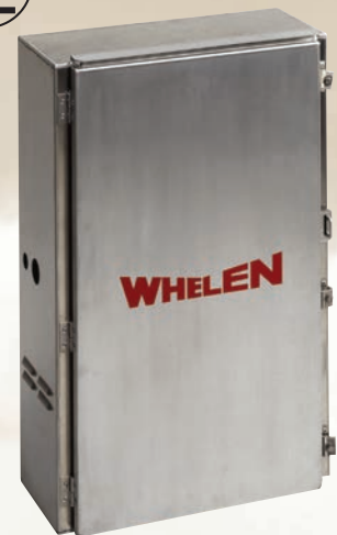
TYPE I Electronic Cabinet