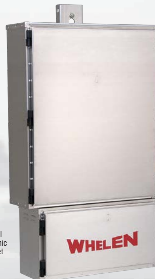
Type II Electronic Cabinet