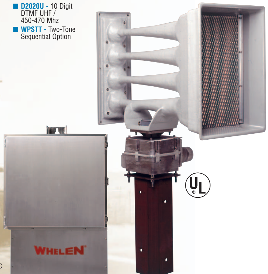
TYPE II ELECTRONIC CABINET