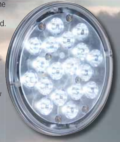
Landing Light PLED462L