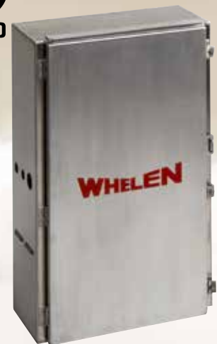
TYPE I Electronic Cabinet