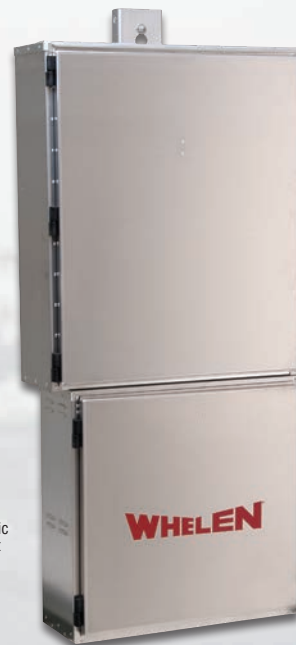
Type III Electronic Cabinet