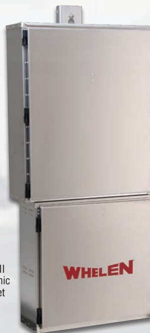
Type III Electronic Cabinet