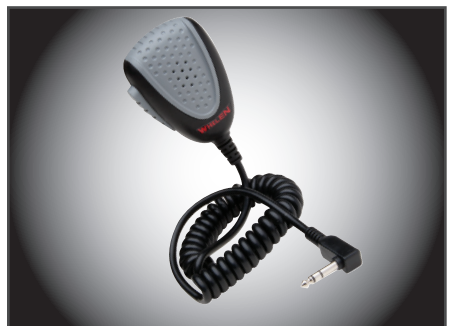
Microphone for WS321 Noise canceling microphone