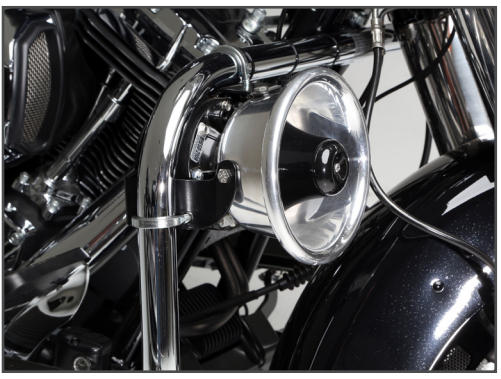
NEW Siren Speaker and Mounting Bracket 100 watt speaker with polished aluminum flare SA350MH, SA350MB1