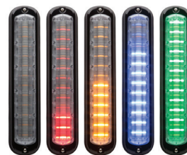
Fluid Level Indicator Light