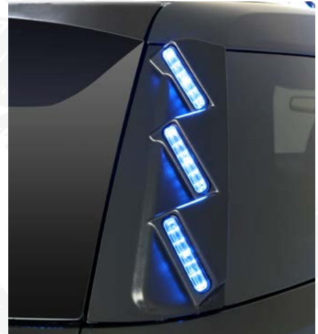
Ford Police Interceptor Utility