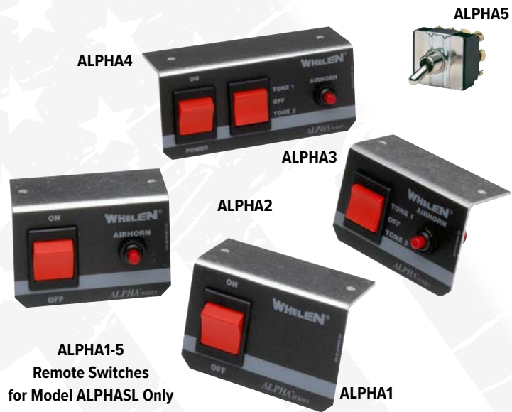
ALPHA1-5 Remote Switches for Model ALPHASL Only

Contacts rated at 30 amps. ALPHA 1-4 Switches include "L" mounting bracket. NOT for motorcycle use.